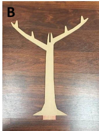
Lower Tree Trunk