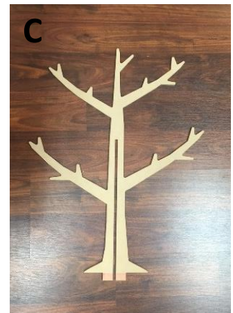
Upper Tree Trunk